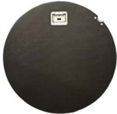
318L Manhole With Stainless Steel Handle & Pryplate

Testing was witnessed by an official from Los Angeles County of Public Works. Test results and other technical data is available from Morrison Bros. Co. upon request.