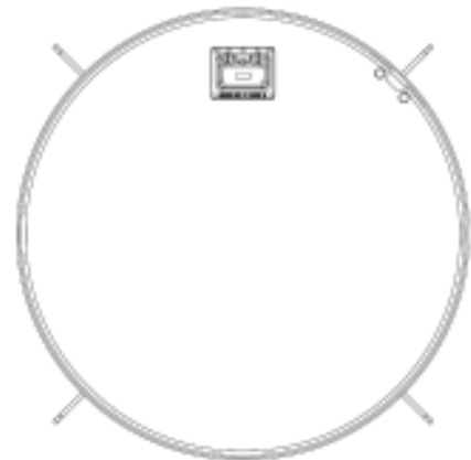
318L: Non-Bolt-down Version