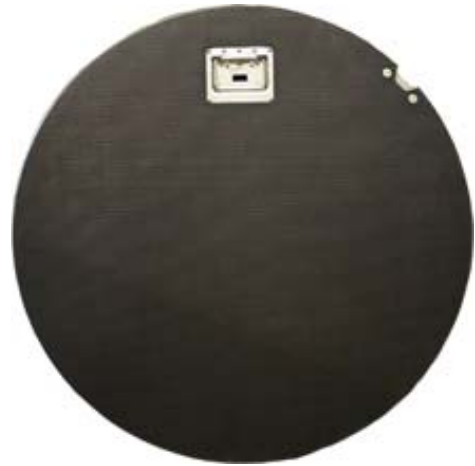
318L Manhole With Stainless Steel Handle & Pryplate

Testing was witnessed by an official from Los Angeles County of Public Works. Test results and other technical data is available from Morrison Bros. Co. upon request.