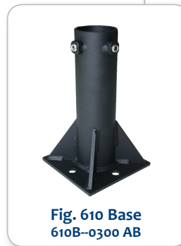
Fig. 610 Base 610B--0300 AB