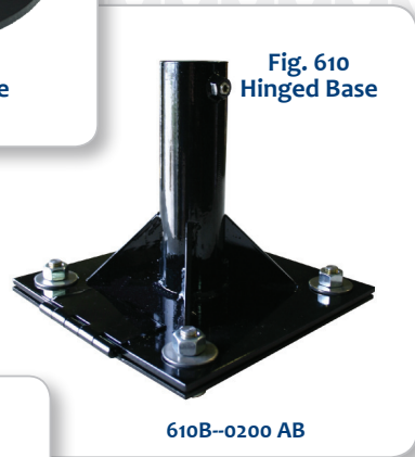
Fig. 610 Hinged Base