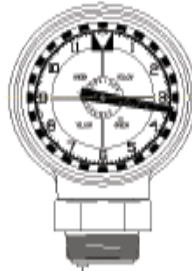
Floating Suction Face Plate