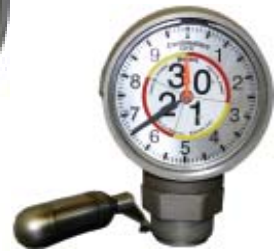
Fig. 818MET With Drop Tube Float

The Morrison Fig. 818 Clock Gauge is used for measuring liquid level in aboveground storage tanks. Readout format is on a standard 12 hour clock face. Small hand represents feet and the large hand inches. Gauge can be read up to 20-30 ft. away to within 1/8". Maximum measurement capability is 12 feet. The gauge can be rotated 360° after mounting. Vapor tight up to 5 psi.