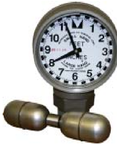
Fig. 818 With Standard Float