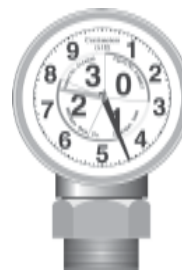
Metric Face Plate