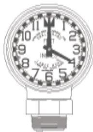
Standard Face Plate