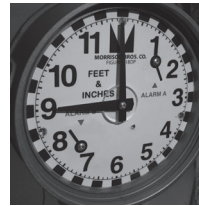
FIGURE 5: Hold thumb nut at desired trip point. Example- Alarm set point at 9 feet - 0 inches.