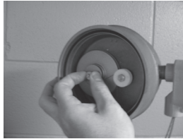
FIGURE 4: Raising the float with thumb nut to desired alarm trip point.